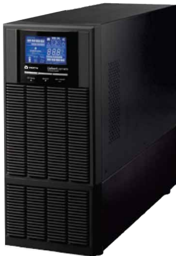
Liebert® GXT MTX+ 6KVA