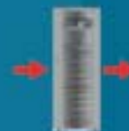
Hot Stand-by Configuration